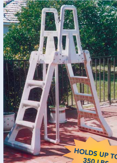
Model No: 1-7177-006