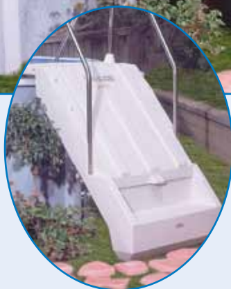
Model No: 1-7999-006